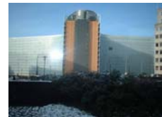
Commission Headquarters Building: The Berlaymont, Brussels