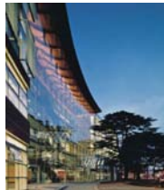
Fingal County Offices, Dublin