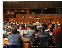
Public Hearing - IMCO Committee, European Parliament