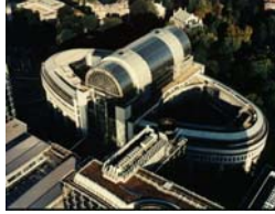
The European Parliament, Brussels