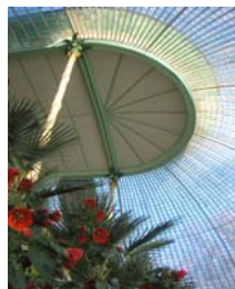
Renovated Greenhouse, Prague