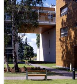
Eko Park - Warsaw, Poland - APA Kurylowicz & Associates